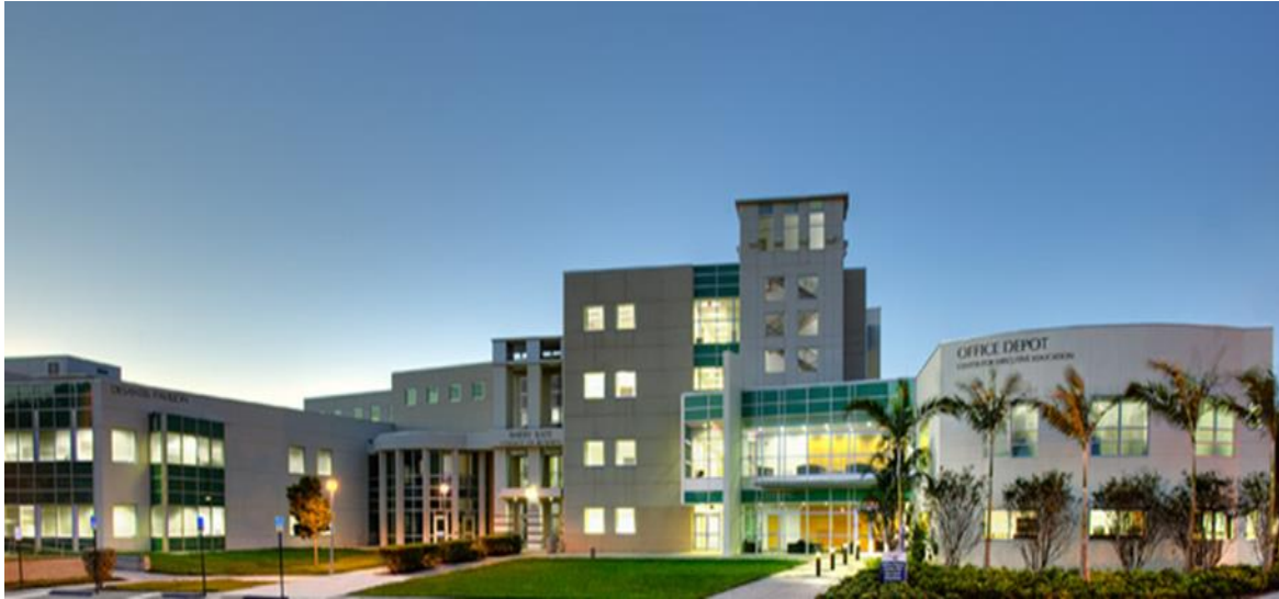
Florida Atlantic University, College of Business, Boca Raton Campus